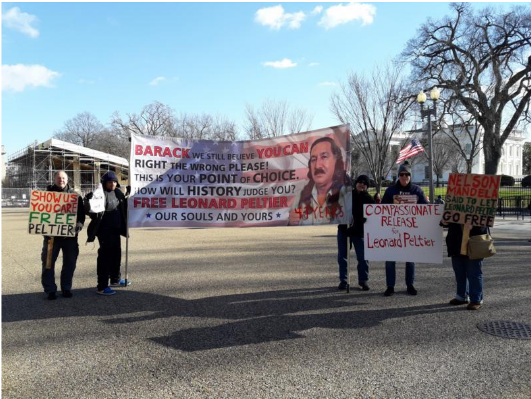
Finally we had some banner and sign holders for some time.